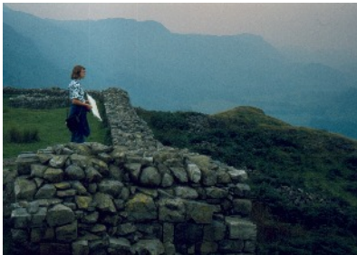
Roman fort - Hardknott Pass

Anyway, the extensive remains in Bath reminded me of a much more remote Roman location: the fort on the high and rugged terrain of Hardknott Pass in the Lake District. The huge fort was built on the rock at 800' above sea level, so as to house around 500 soldiers plus their followers. Many thousands of tons of rock and earth were hacked out to make a parade ground about 50% larger than a standard football pitch. And, of course, there had to be a bath house with the necessary collection of hot and cold baths.